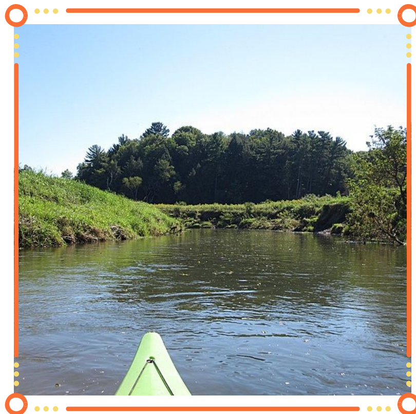
The river after the cleanup last year

You can find Rivercleanup in Platina at river Ham (Freestreet 111, 777 Platina). There are also canoes available at tourist island and in Ruby'lu near river Lu. All places are open from 10 a.m. – 5 p.m.